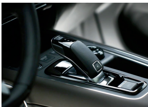
Efficient Automatic 8-speed Transmission