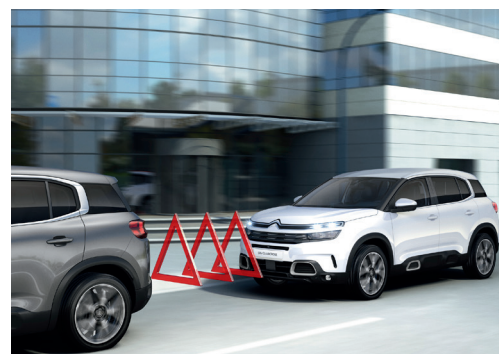
Active Safety Brake