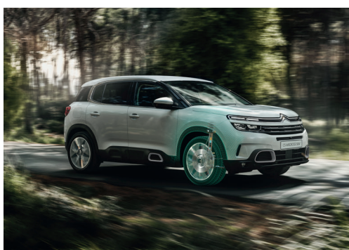
Progressive Hydraulic Cushions®