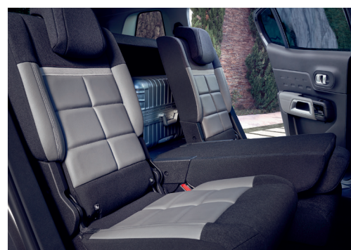
Individually Adjustable Rear Seats