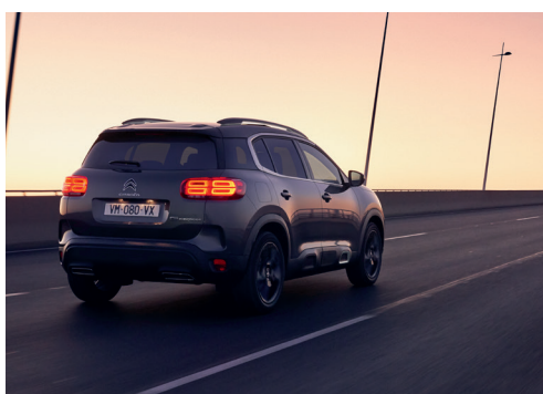
Award Winning Turbocharged PureTech® Engine