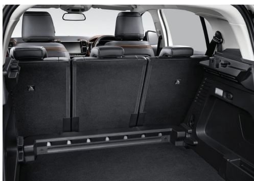
Generous boot space of up to 1,630l*