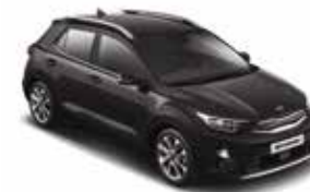
Aurora Black Pearl (ABP)