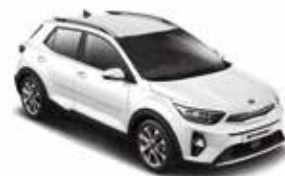
Clear White (UD)