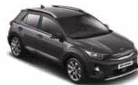
Platinum Graphite (ABT)