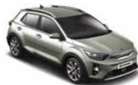
Urban Green (URG)