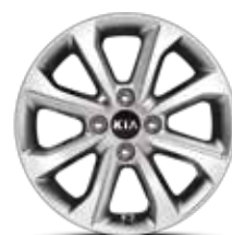
15-inch Alloy Wheel