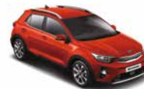
Signal Red (BEG)