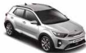
Silky Silver (4SS)