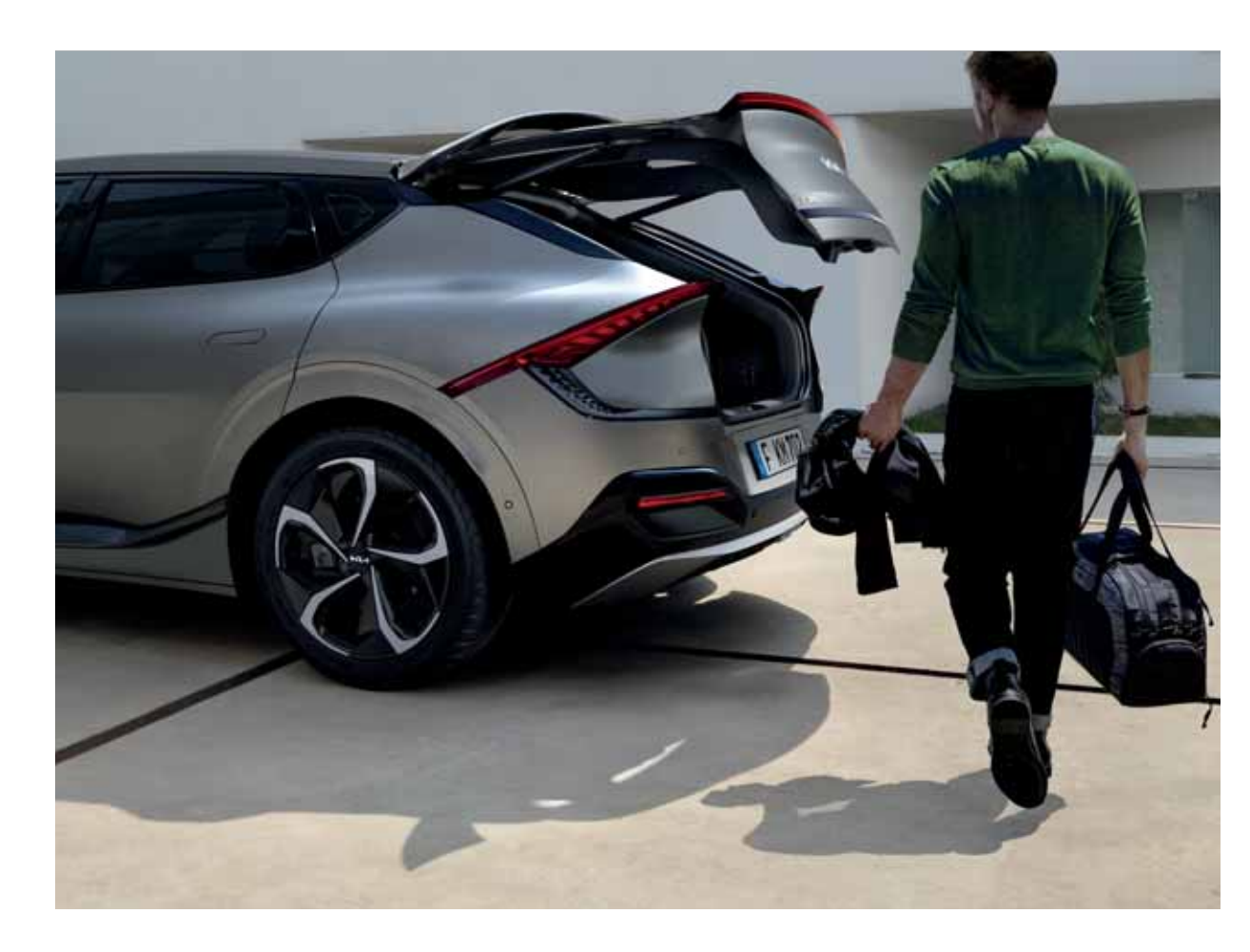
Smart power tailgate. The power tailgate can be set to open automatically to a desired height. Stand behind the parked Kia EV6 for three seconds, and the tailgate will open automatically.