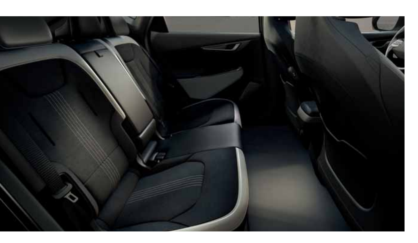
Second-row seat comfort. The slim front seats, the unique E-GMP platform layout and the flat floor give rear passengers more legroom. There are headrests in every position, and a centre armrest incorporates a storage box with sliding cupholder. Air vents on the B-pillars offer refreshing airflow.

With a flat floor and a broad-shouldered frame, the Kia EV6 gave our designers more freedom to create the best design for you. The seats take up less space, but deliver more. The zero-gravity Relaxion comfort seats provide a wide range of settings so that your body is in its most comfortable position, minimizing the fatigue or discomfort you might have experienced with conventional seats, especially on long drives or when you're waiting for your car to top up its battery. Because when you're more relaxed, ideas flow better.