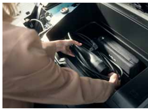
Front storage trunk (20 \ell , 52 \ell ). Extra space is a useful benefit of the new Kia EV6 platform. That includes a convenient storage space under the front bonnet. It holds up to 20 \ell on AWD models and up to 52 \ell on 2WD models.