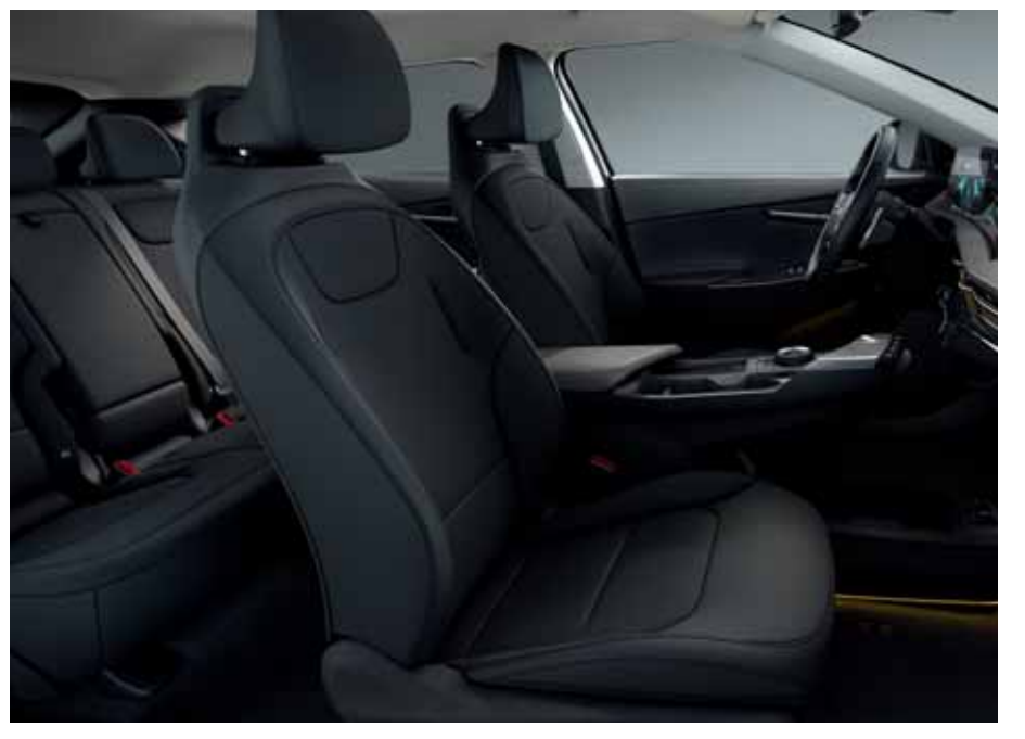
Single Motor Standard Range - Standard black vegan leather