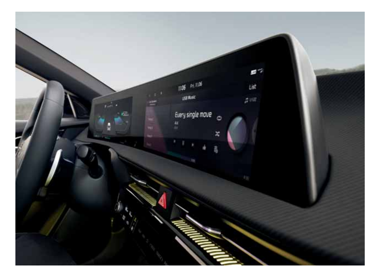
The dual 12.3" panoramic curved displays. The Kia EV6's integrated curved displays are not only beautiful, but offer a truly immersive experience. They enhance the driving experience by providing high-definition navigation and important information, with minimal controls for an unobstructed and easy driving experience.

The immersive dual 12.3" panoramic curved displays enhance your driving experience by providing important information without you needing to take your eyes off the road. Along with a sound system designed to bring an immersive hi-fi listening experience to every seat. And in case your phone is running out of battery, the Kia EV6 comes equipped with a range of charging ports that complete the inspirational character of the interior.