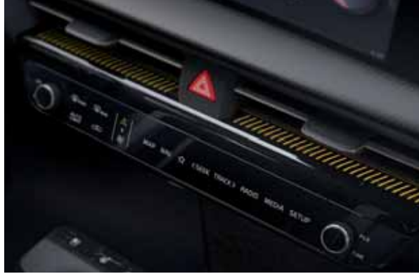
Infotainment/climate switchable controller. The switchable controller offers an intuitive way to interact with the car, while keeping all important information easily accessible. Press the one-touch infotainment icon or climate icon, and the relevant menus to make any adjustment you desire.