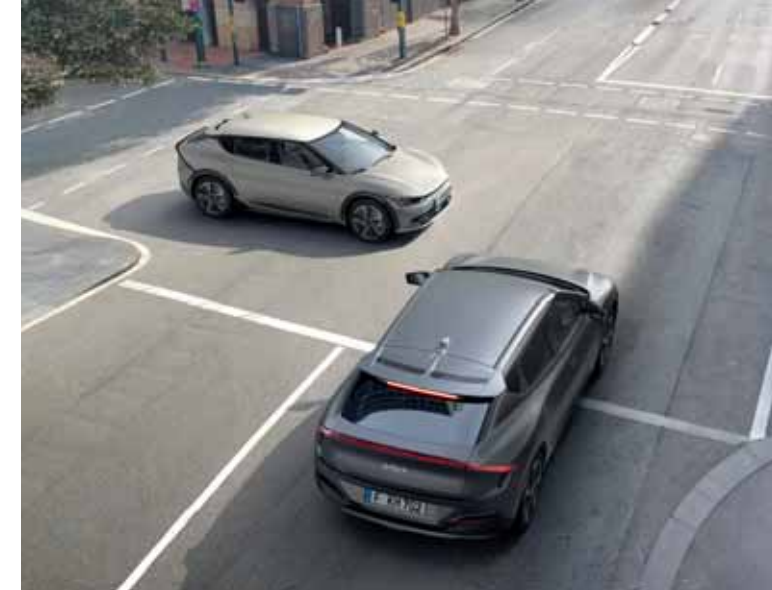
Forward Collision-Avoidance Assist with junction turning and crossing (FCA). FCA uses a front-view camera and radar to detect any vehicles, pedestrians or cyclists ahead. By warning and braking automatically, it can help you avoid, or reduce the severity of, an accident. The system also engages if you are crossing or turning at an intersection.