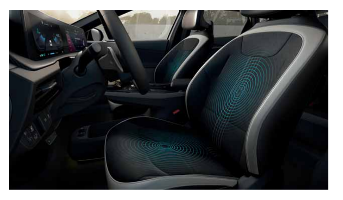
Heated and ventilated seats. Ventilated front seats give the driver and front passenger a more comfortable ride when the weather is warm or humid. Control the fans using the console touch buttons and adjust the levels of heating to meet the needs of passengers in the front and rear.