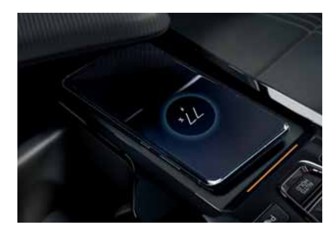
Wireless phone charger. The charging pad in the front centre console lets you charge compatible mobile phones wirelessly. It operates with up to 15W of power, so charging is reassuringly fast.