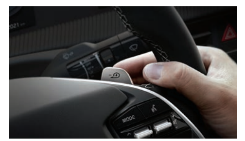
Smart regenerative braking system (SRS 2.0)