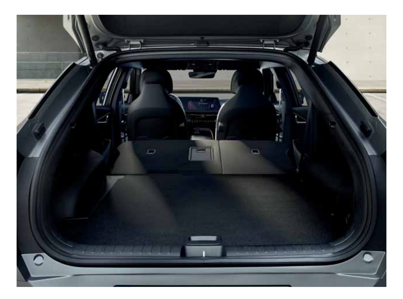
Remote second-row seatback folding. Pull the remote release lever on the wall of the cargo space to fold the rear seatback down, creating 1,300 \ell of storage capacity. With the lever's convenient location, it's like having an extra pair of hands when you need to load long or bulky items.