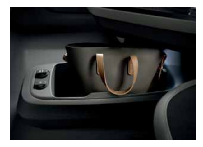
Console tray. The center console includes an armrest, cupholders, a wireless charging pad above, and an open tray below that can hold shoes, tablets, or handbags.

When you're starting from scratch on a new platform, the possibilities are endless. Especially when it comes to cargo storage. The Kia EV6 lets you store items in places you never imagined. Under the front bonnet, under the rear cargo floor, under the cargo screen and even in spaces between and under the seats. But in case you need to accommodate even bigger items, the rear seats also fold. Because ideas come in a wide range of sizes.