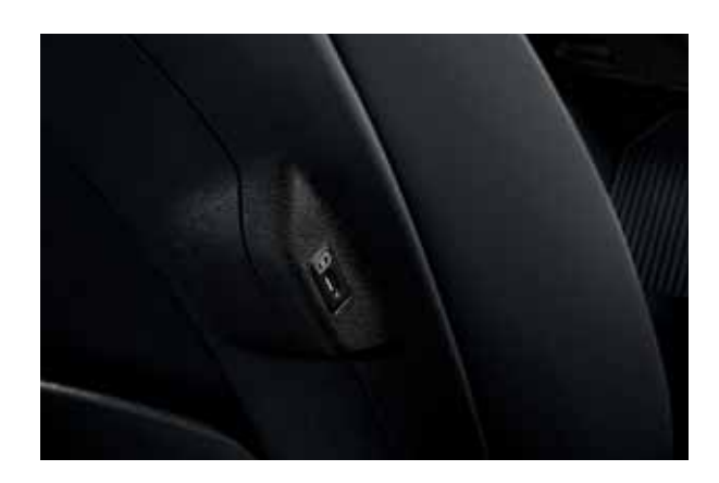
USB ports on seatbacks. Convenience is important for everyone on board. Rear seat passengers will find USB ports in the seatbacks in front of them, so they can power their devices whenever they want.