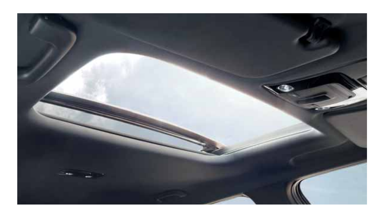
Wide sunroof. Airflow adds to the sense of openness. The roomy dimensions of the Kia EV6 seem to expand with the wide tilt-sliding sunroof. It takes full advantage of the roof geometry, offering a broader opening for light and breezes to get inside.