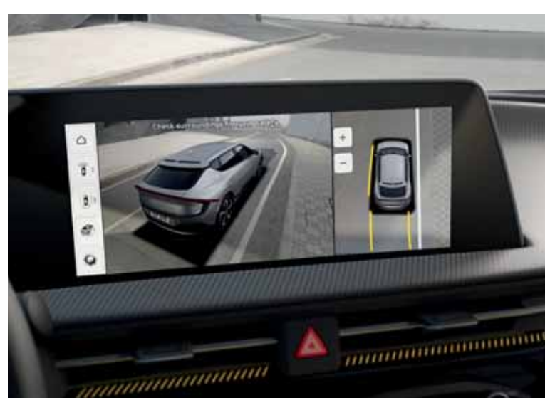
Surround View Monitor (SVM). When manoeuvring in confined spaces, multiple cameras give you a zoomable, 360° overhead view around the vehicle, so you can steer and park with confidence. There is no need to exit the vehicle to check clearances or ask others for help.