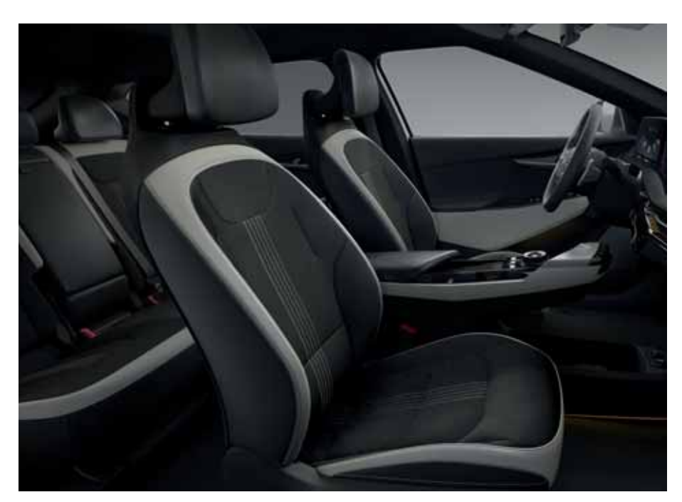
GT-line - Standard black suede with vegan leather bolsters.

From soft, durable suede, to vegan leather and recycled materials: the Kia EV6 is ergonomically designed for your body's comfort and your peace of mind. Eco-friendly and sustainable. It's not just about style. This is a new way of being.