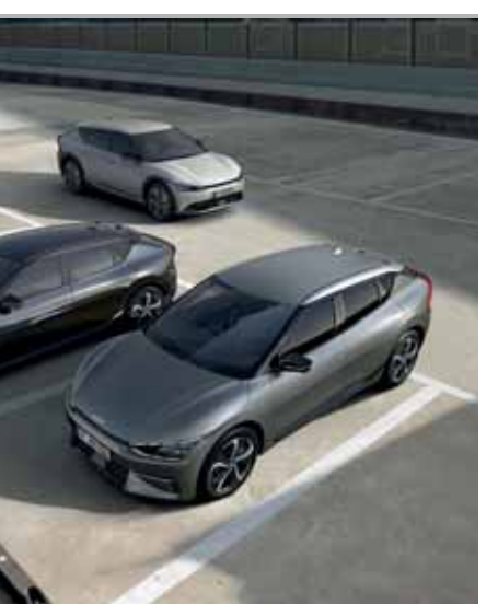
Rear Cross Traffic Avoidance Assist (RCCA). If there is a risk of collision with an oncoming vehicle on the left or right side while reversing, RCCA provides a warning. After the warning, if the risk of collision increases, RCCA automatically assists with emergency braking.

With Remote Smart Parking Assist (RSPA) you can park or unpark the Kia EV6 even if you aren't inside. Using sensors, RSPA can safely move the Kia EV6 into or out of a parallel or perpendicular space. Braking is automatic if an obstacle is detected.