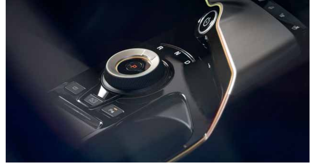
Shift By Wire (SBW). All you need to do to change gears between Reverse, Neutral and Drive is brake and turn the dial of the Shift by Wire system left or right. The P button puts the Kia EV6 in Park mode.

Drive Mode Select (DMS). The Kia EV6 can adjust to the way you like to drive. Choose Normal, Sport or Eco drive mode using steering wheel or voice controls. Sport mode lets you accelerate more quickly, while Eco saves energy to extend your driving range. Each mode has a theme display on the cluster screen with unique visual effects that may also switch from white to black at night.