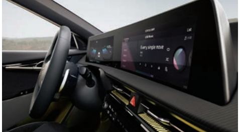
12.3" Dual panoramic curved display