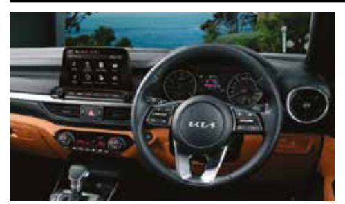
Steering Wheel Remote Controls