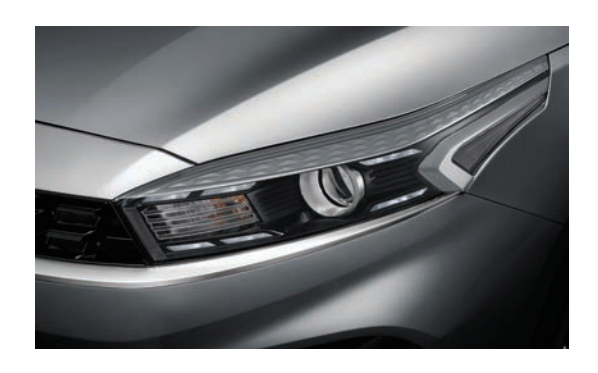
Bulb headlamps with LED DRLs (L only)