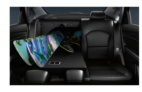
60:40 split folding seats