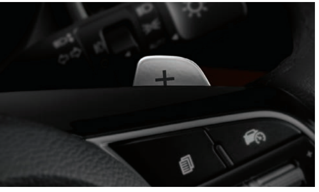
6-speed automatic transmission The 6-speed automatic is silky smooth and precise.