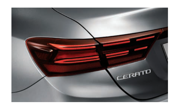
LED rear lamps (EX & GT Line only)