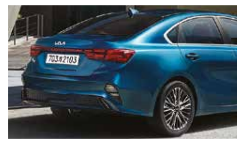
Front and Rear Fog Lamps