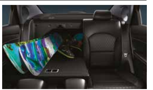
60:40 Split Folding Rear Seats