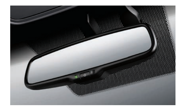
Electrochromic rear view mirror (GT Line only)