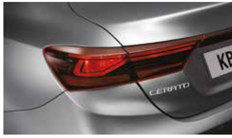
Bulb-type Rear Combination Lamps