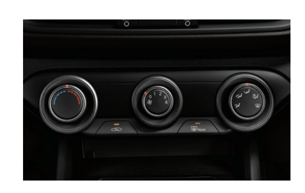
Manual temperature control (L & EX only)