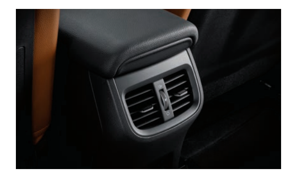
Ventilation for 2nd row passengers (EX & GT Line only)

Which features make the Cerato the ideal place to spend your commute? That's entirely up to you. Choose the audio, convenience and automation options that reflect your definition of perfection. Make sure every minute you spend in the Cerato is quality time.