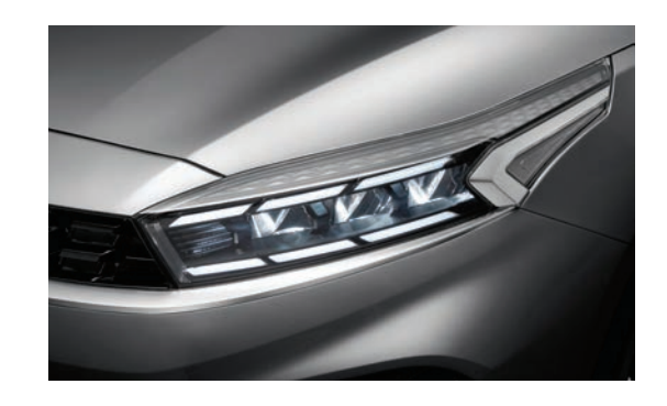
Full LED headlamps (EX & GT Line)