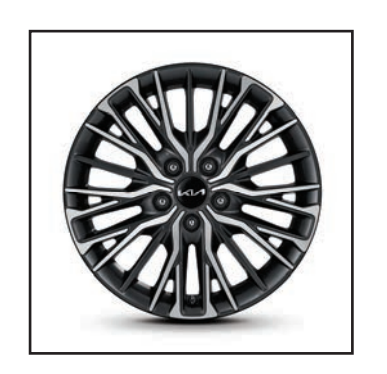
17" GT Line Rim