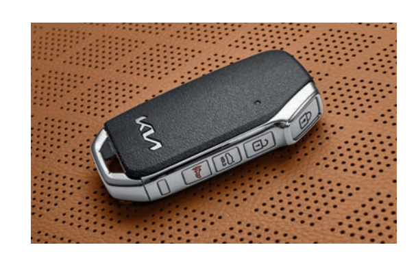
Smart key (EX & GT Line only)