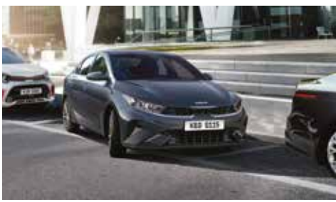
Rear Parking Distance Warning

Working in concert with the motor driven power steering, Kia's VSM helps ensure that the Cerato remains stable when simultaneously braking and cornering.