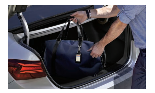
502ℓ cargo capacity