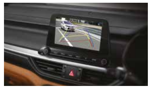
Rear View Monitor

PDW uses ultrasonic sensors on the rear bumpers to warn of any obstacles helping you to position the wheels properly when maneuvering into tight spaces.