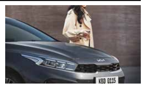
LED Daytime Running Lights