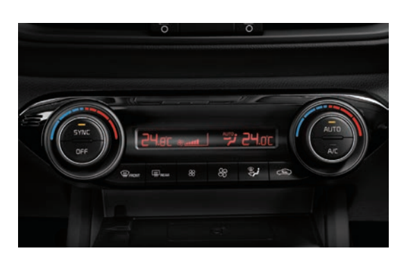
Dual-zone full auto temperature control (GT Line only)