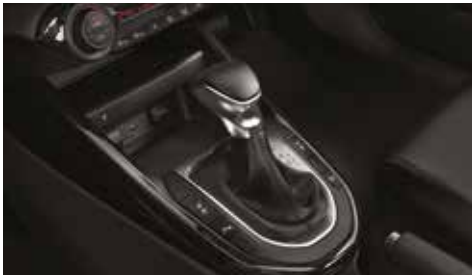
6-Speed Automatic Transmission