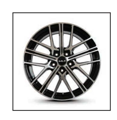
16" EX Rim