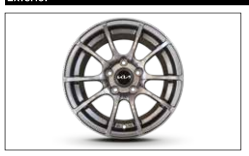
15" Alloy Rim