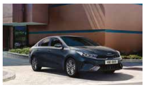
Hill-Start Assist Control

When you're on a steep upward incline, pulling away from a standing start can be a concern, but don't worry, HAC is designed to stop you from rolling backwards.